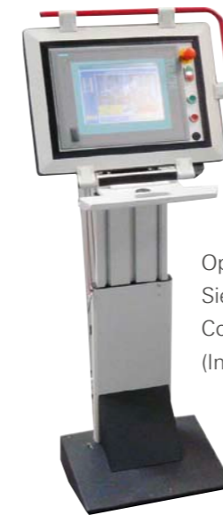
Operating panel Siemens S7 Controller (Industrial PC)