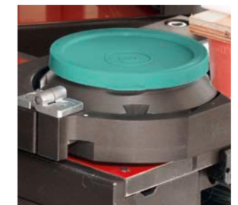
Patented MCI ink cup (compact colour dispensing system)