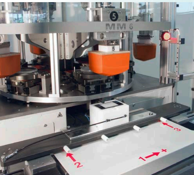
Photo: The position of the workpiece is corrected on axes 1, 2 and 3. In addition an angular correction is made by counter-directional movements of axis 2 and 3.

The system is equally suitable for printing on large workpieces because it can move to a number of different positions.